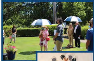
Honorees at the dedication